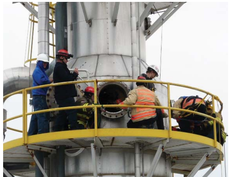
On Wednesday, Sept. 14, 2011, the Milton Fire Department and the Stateline Technical Rescue Team made up of 11 stateline fire departments from three counties participated in extraordinary technical rescue training at United Ethanol. At the top of the beer column above, the rescue team in training prepares the rigging for entry of personnel into the side-entry man way.

A new product is being tested as an emulsion breaker to replace what we’re currently using in corn oil recovery. Estimated savings from this alteration is $4,000 per month. We’re also investigating the implementation of a bulk storage and metering system for